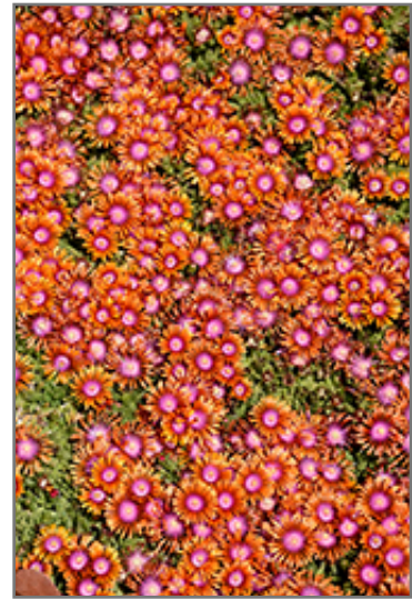
Fire Spinner Ice Plant flowers